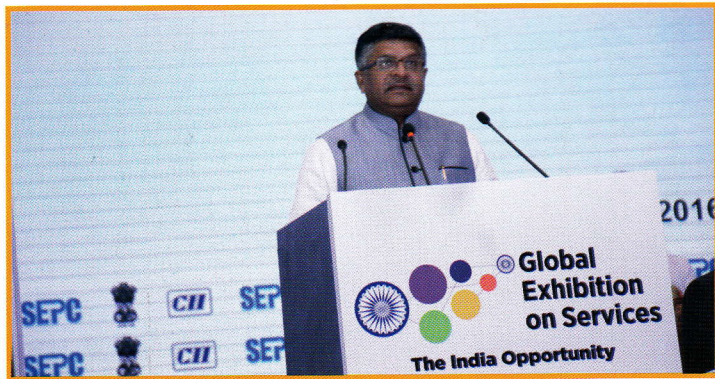
Sh. Ravi Shankar Prasad

Minister for Communications & Information Technology and Law & Justice, Government of India in GES 2016