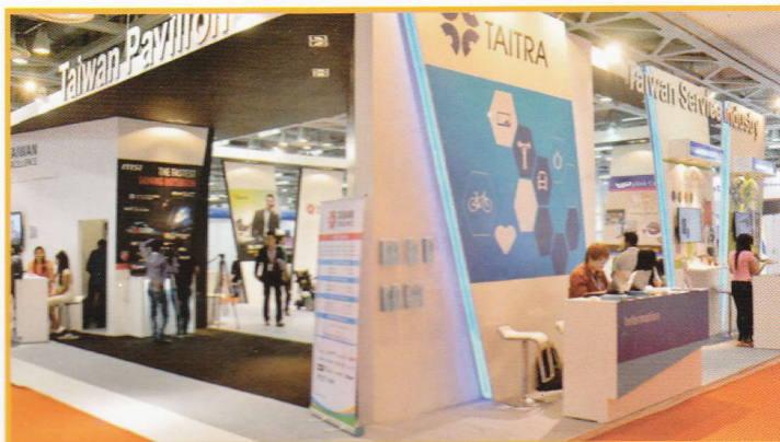
Exhibition Showcase in GES 2016