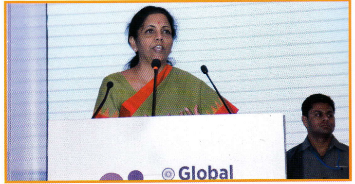
Smt. Nirmala Sitharaman

Minister for Communications & Information Technology and Law & Justice, Government of India in GES 2016