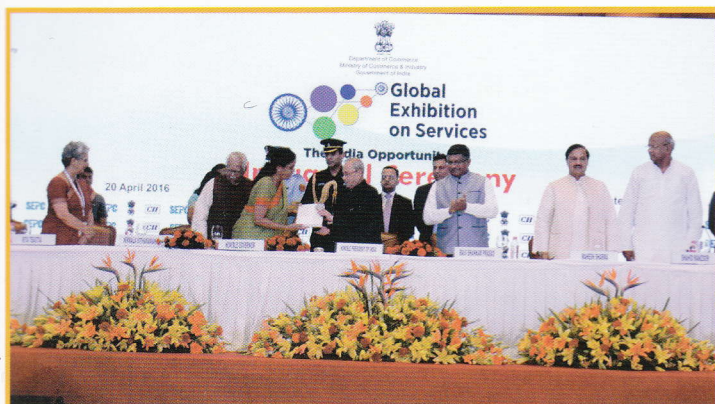
Inauguration of GES 2016 by Hon'ble President of India, Shri Pranab Mukherjee on 20 April, 2016